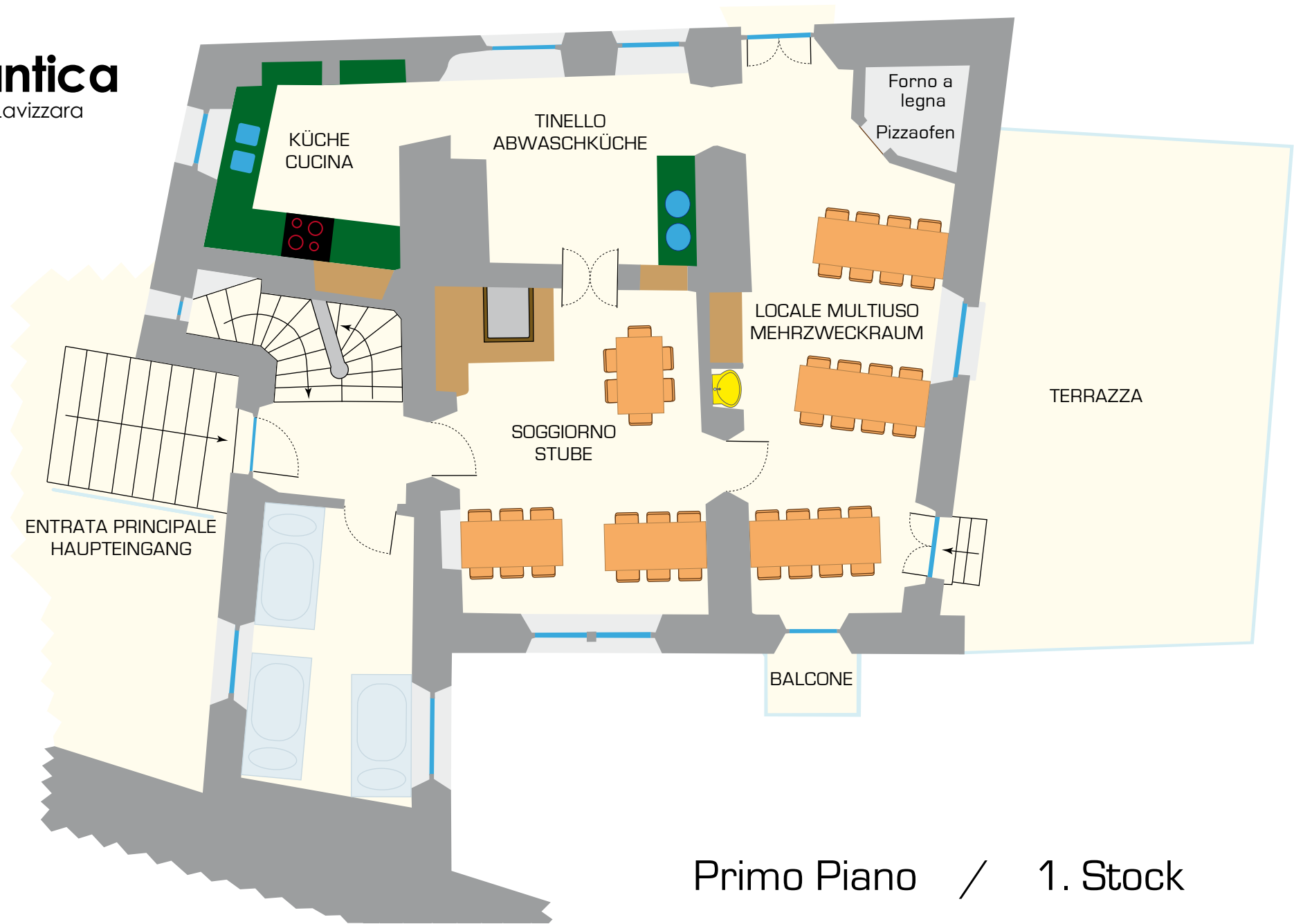
Primo Piano / 1. Stock